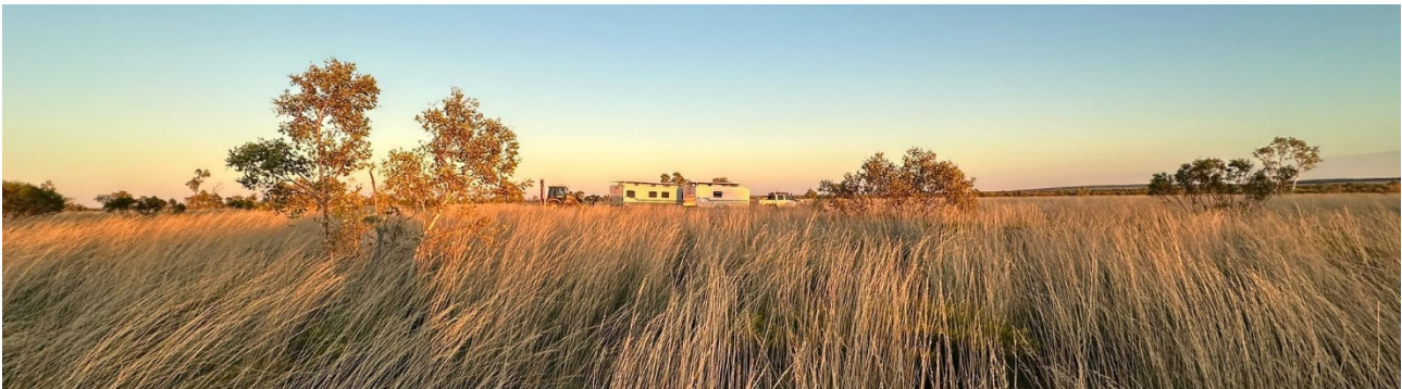
Figure 1: Sultan Exploration Camp, West Tanami